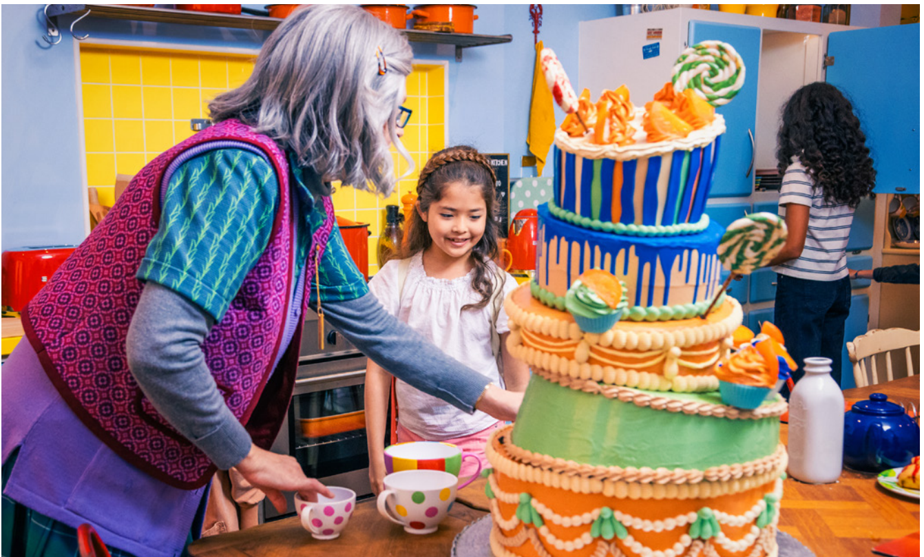
Image: © The Official Paddington Bear™ Experience. P&Co. Ltd./SC 2026

https://paddingtonbearexperience.com/schools/