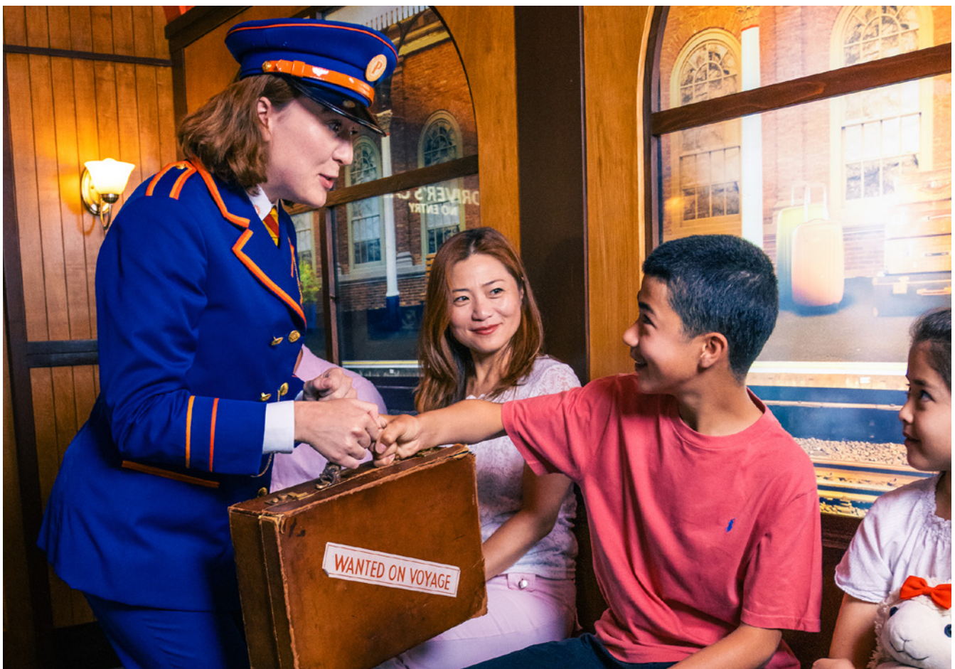
Image: © The Official Paddington Bear™ Experience. P&Co. Ltd./SC 2024

https://paddingtonbearexperience.com/schools/ schools@paddingtonbearexperience.com